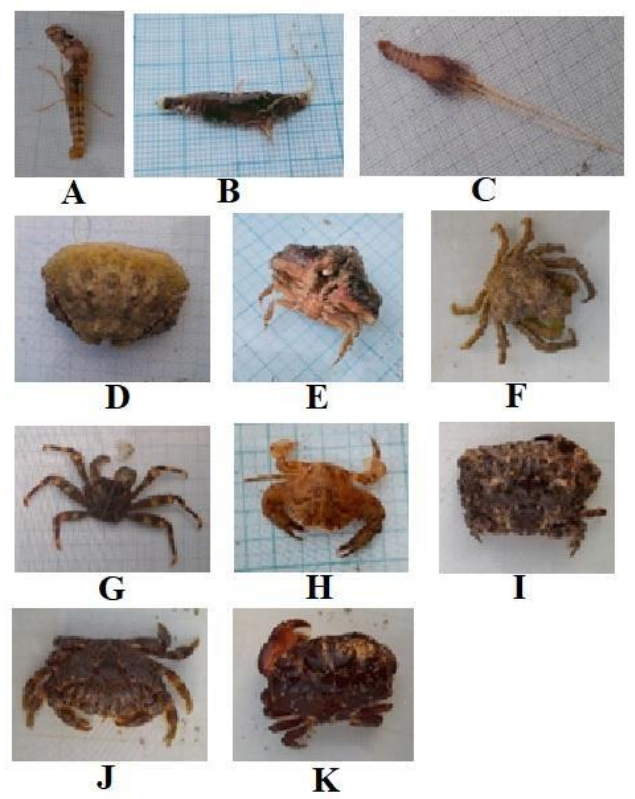
Figure 2. Crustaceans have been collected il Lendang Luar Beach. (A) Alpheus heterochaelis, (B) Alpheus sp, (C) Panulirus versicolor, (D) Calappa japinca, (E) Calappa ocellata, (F) Libinia emarginata (G) Percon gibbesi, (H) Charybdis annulata, (I) Xanto pilipes, (J) Zosimus aeneus, and (K) Atergatis floridus.