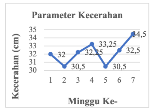
Figure 2. Temperature Parameter Measurement Results