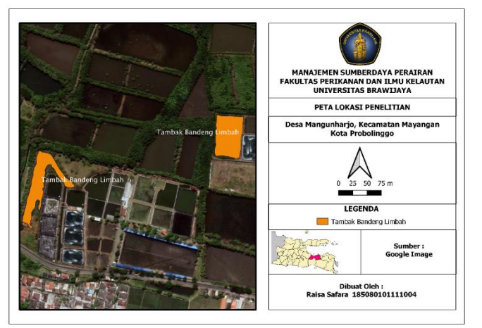
Figure 1. Research location for milkfish ponds with water sources left over from rearing vanname shrimp

The research location was in milkfish ponds in Probolinggo City, East Java, with water sources from the remains of rearing vaname shrimp or pond water that had been used to raise vaname shrimp for 120 days. Water samples are taken every week at around 09.00 WIB from March to April 2022. The pond area is 2000 m2, the water level is 0.7 m, filled with 4000 18-day-old milkfish seeds. Water quality began to be observed when the milkfish were 2 months to 3.5 months old. A map of the research location can be seen in Figure 1.