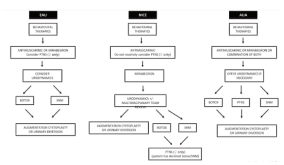
Figure 2. Comparison of NICE, EAU and AUA guidelines for the management of OAB. AUA, American Urological Association; EAU, European Association of Urology; NICE, National Institute for Health and Care Excellence; OAB, overactive bladder; PTNS, posterior tibial nerve stimulation; SNM, sacral neuromodulation.<sup>5</sup>