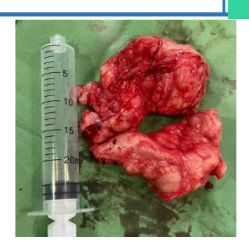
Figure 2: Prostate mass had been removed

The patient was diagnosed with Prostatic Hyperplasia grade 4 and was planned to have an Open Prostatectomy. The operation was carried out on November, 24th 2022 in the operating room of the NTB Province Hospital. After being anesthetized with Spinal Anesthesia, the patient is placed in a recumbent position and begins with aseptic and antiseptic procedures followed by installation of a sterile drape, followed by a suprapubic mid line incision and deepening of the incision into the fascia then identification of the bladder then incision and fixation with a hook. Next, enucleate the prostate mass with a finger and then lift the prostate mass (figure 2). Then send the sample for Anatomical Pathology (PA) examination. Then sew the bladder and fix it with a catheter, then control bleeding and wash the surgical wound. The surgical wound was sutured layer by layer and the operation was completed. The patient was then carried out postoperative care for 3 days in the hospital. Drain removal was carried out on the 7th day without any complaints.